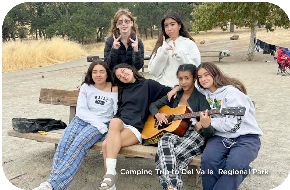
Camping Trip to Del Valle Regional Park