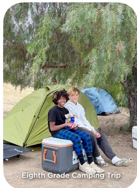
Eighth Grade Camping Trip

of games and a culminating group ceremony, the students set out on their solo night. They set up and slept alone under the stars. They woke up in the morning feeling strong, brave, and ready to conquer their 8th-grade year. ∞