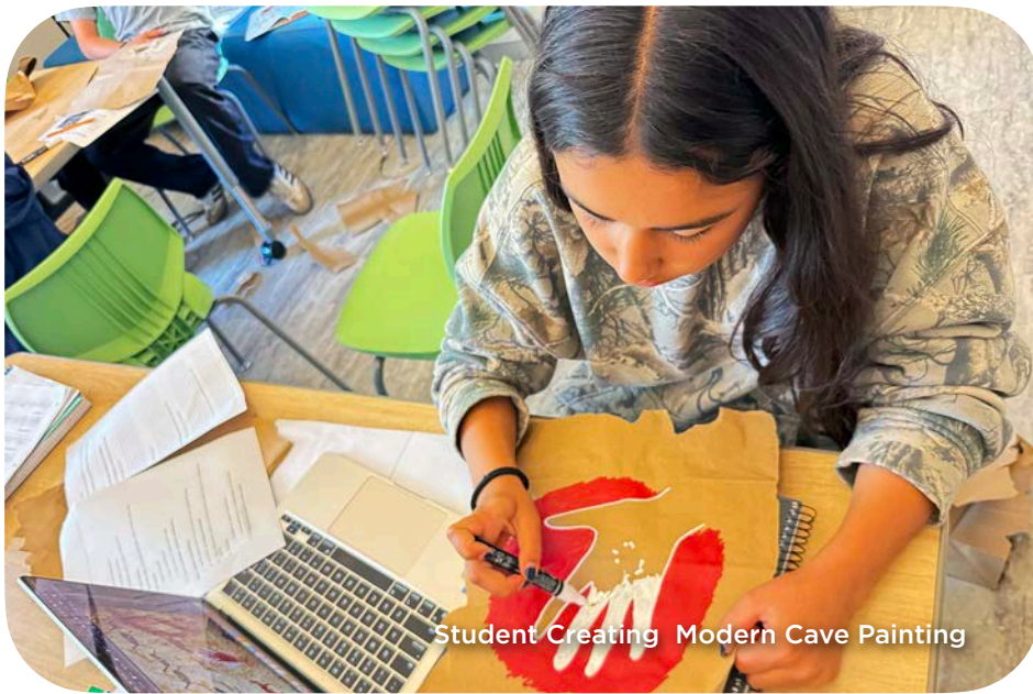
Student Creating Modern Cave Painting