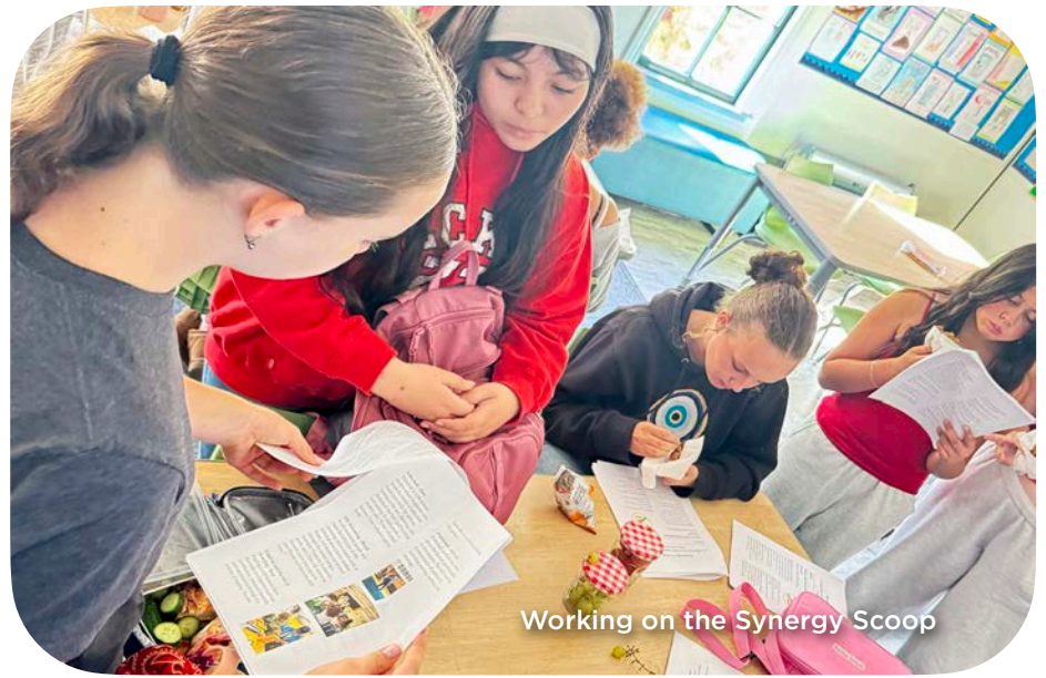
Working on the Synergy Scoop