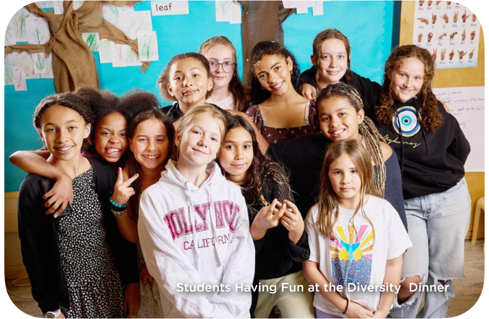
Students Having Fun at the Diversity Dinner