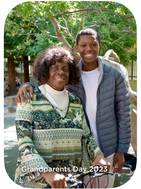
Grandparents Day 2023

The author also answered some questions about her work as the Creative Director of Charles M. Schulz Creative Associates, including how she came up with the design for the Snoopy U.S. postage stamp issued in April 2001.