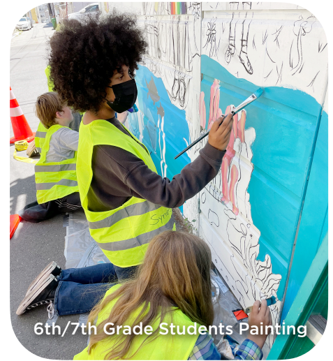
6th/7th Grade Students Painting