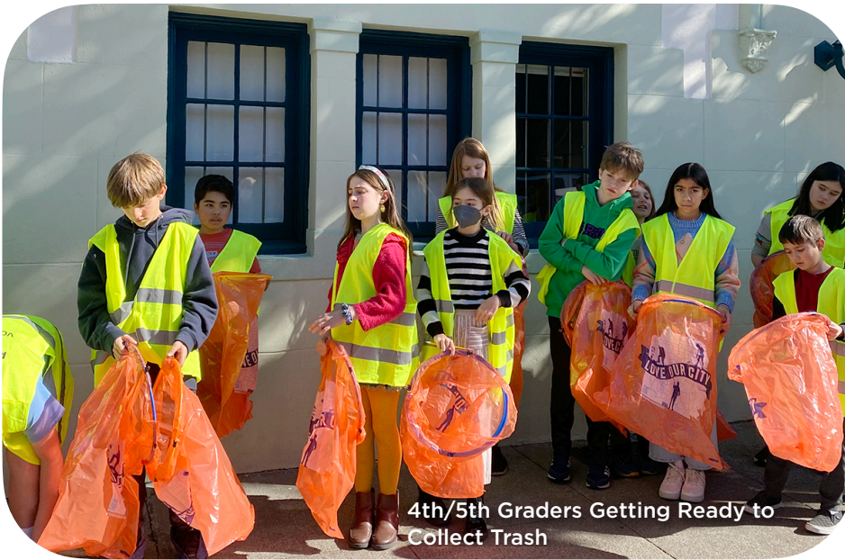
4th/5th Graders Getting Ready to Collect Trash