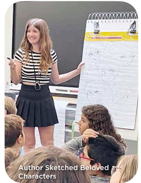
Author Sketched Beloved Characters