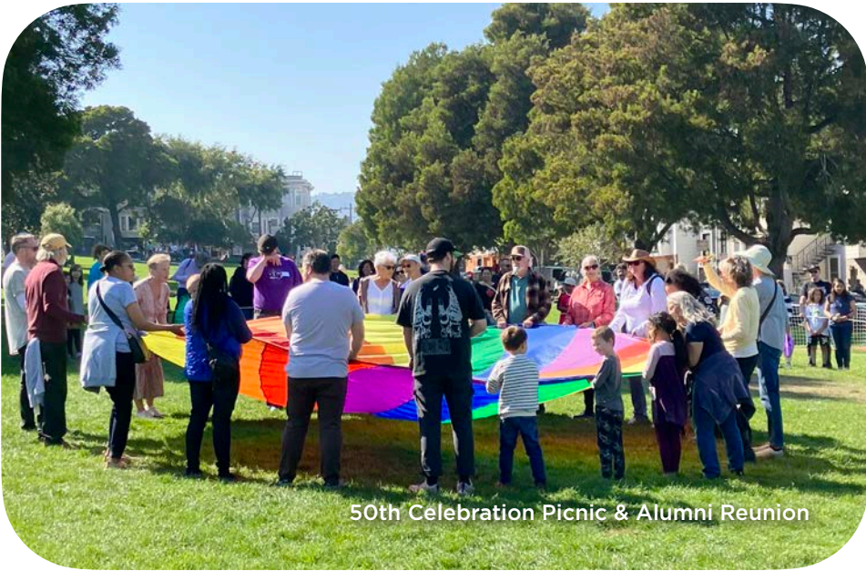
50th Celebration Picnic & Alumni Reunion