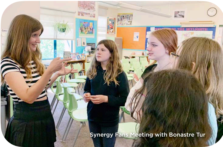
Synergy Fans Meeting with Bonastre Tur